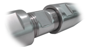
The In-Line Link benefits from the unique crown ring which is used in all compression terminals. See the compression terminal pages for more information.