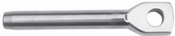
Machined Swage Eyes