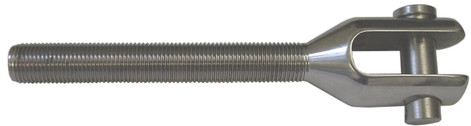
Threaded Terminals - Fork Studs RH & LH